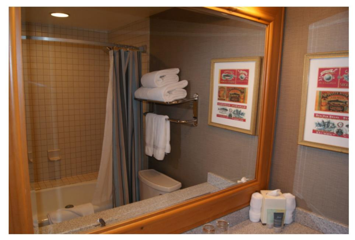
Restroom in a waterview king room at Semiahmoo Resort

The toiletries in the bathroom were the <u>float collection</u> by William Roth. I generally don't take notice of the toiletries provided at hotels, but the product appearance and name was a perfect fit for the resort. The products are heavily scented, but I didn't mind the perfume aroma. My wife on the other hand, found it to be too strong.