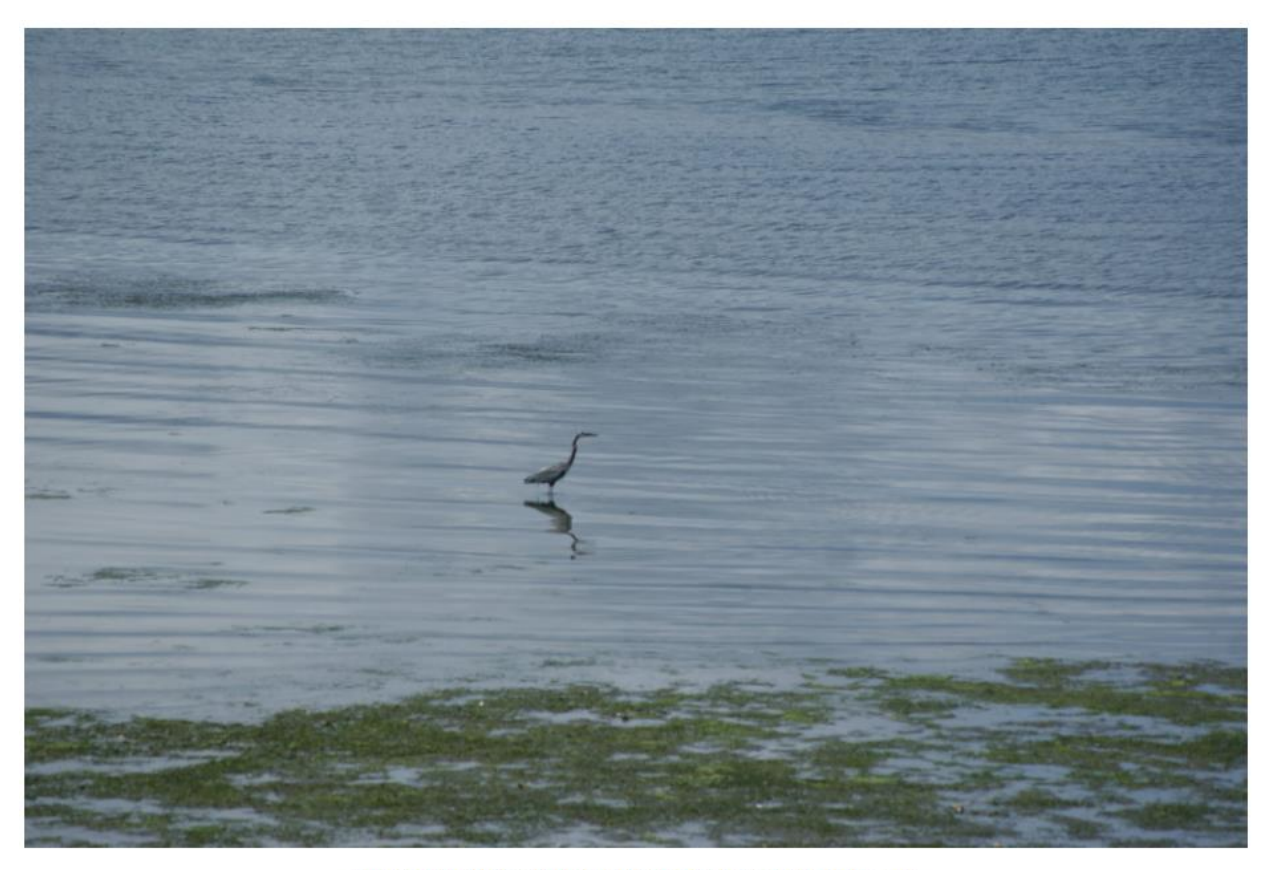
View of the water from the 3rd floor at Semiahmoo Resort