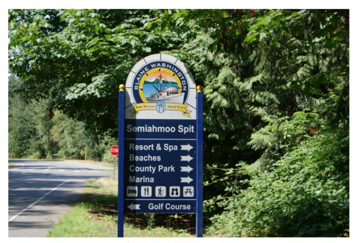
Directional sign at Semiahmoo Resort

The Semiahmoo Resort provides a fun, family oriented experience near the Peace Arch at the Canadian/US border. The entire time I wasn't sitting in conference rooms, I was thinking that it would have been great to have my family with me. There were so many ways to fill the day by exploring the beach, swimming at the pool, and having beachfront s'mores at the fire pit.