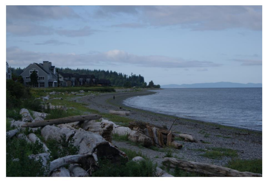
Beach at Semiahmoo Resort