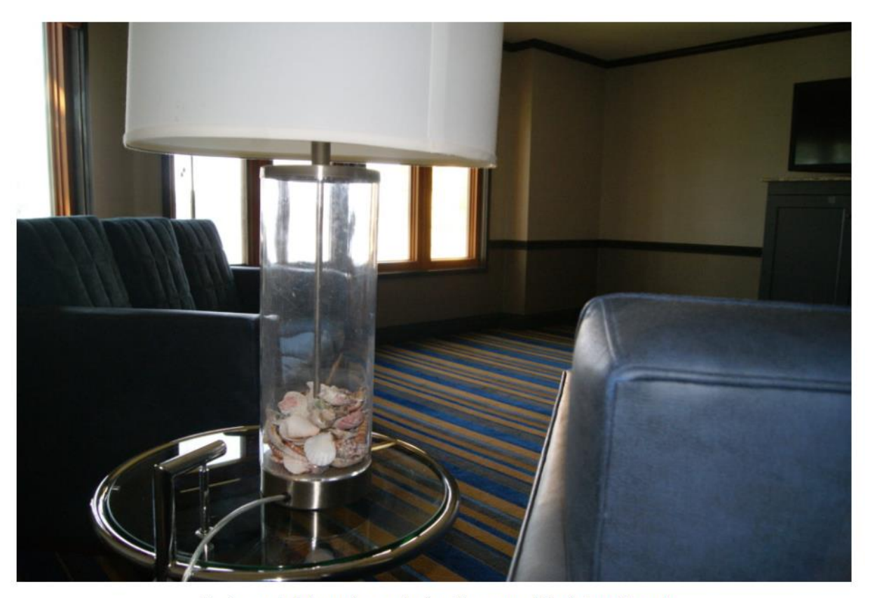
Seating and shell vase in a waterview king room at Semiahmoo Resort