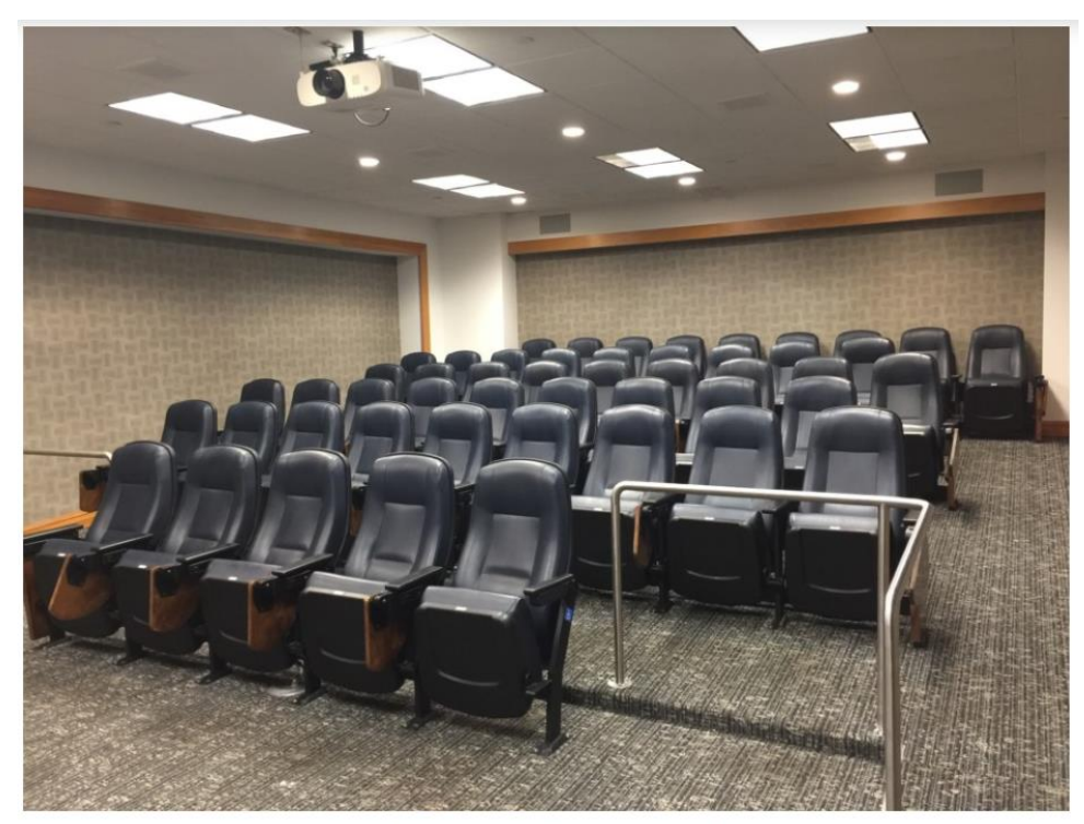
Discovery Theater at Semiahmoo Resort

Tucked away beyond the conference and ball rooms is a movie theater with a 138" screen, HD projector, and 50 leather seats. On Friday and Saturday nights the resort hosts family movie nights at 8pm. The theater is open for guests to use. This would be a great way to spend time with a larger group of friends or a big family.