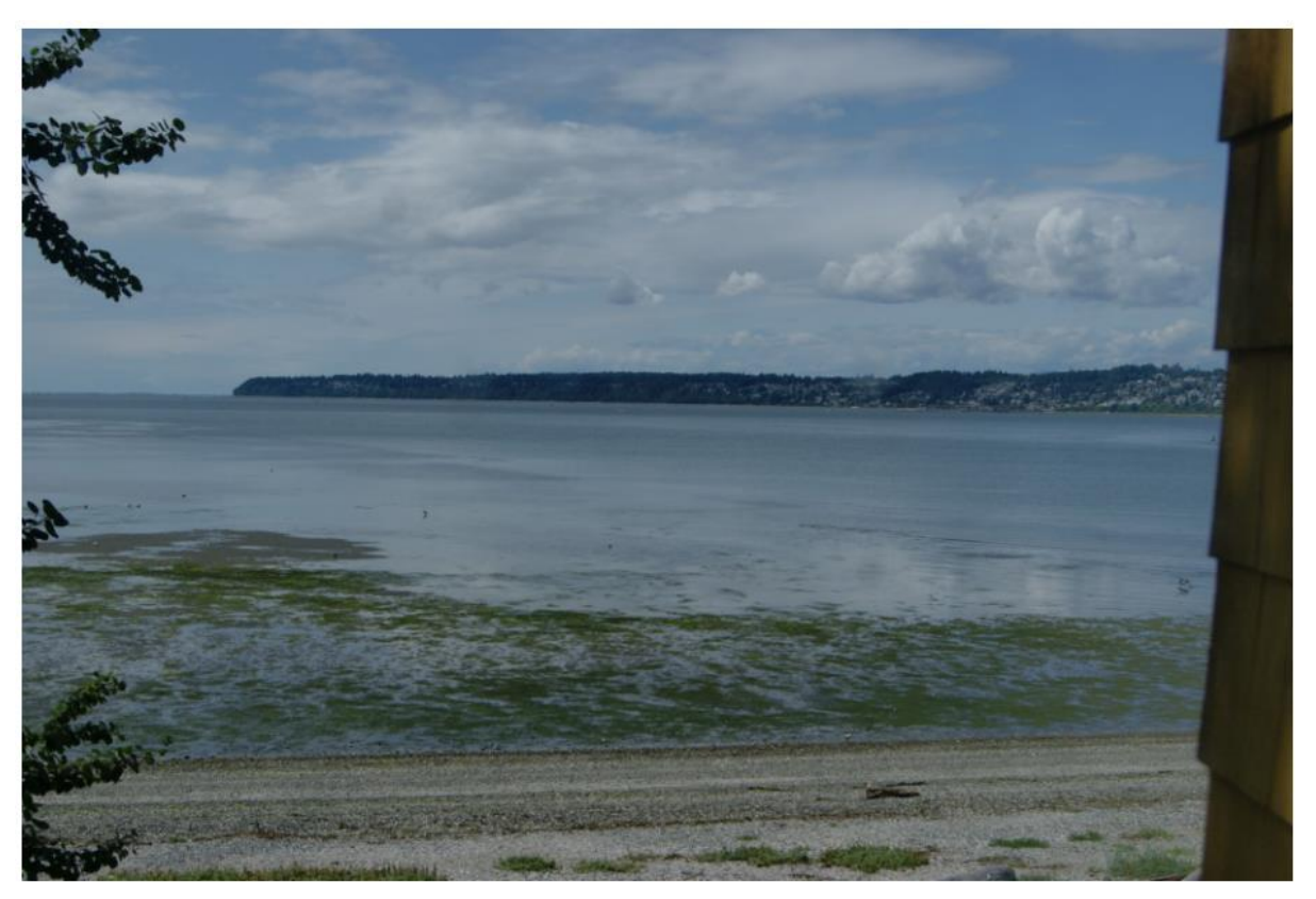
View of Point Roberts from the 3rd floor at Semiahmoo Resort

The room was dated, and in need of a refresh. My room had paint flaking on the ceiling. However, the views of the beach and water were great!