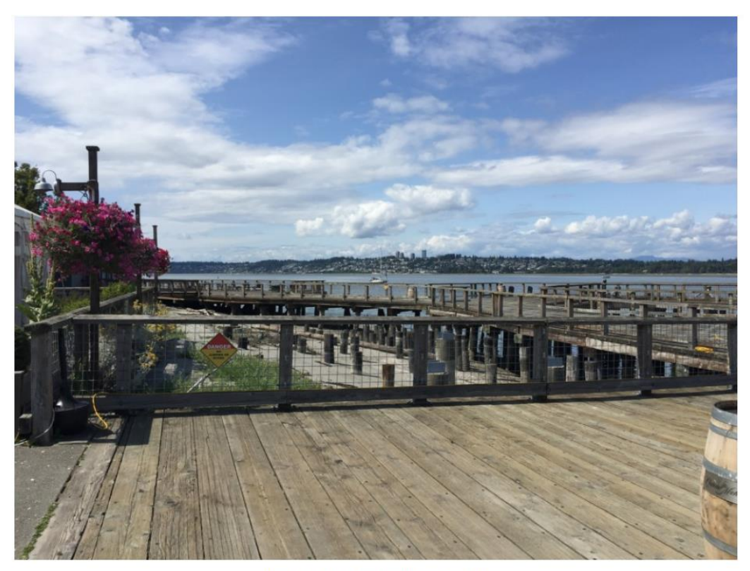
Peace Arch Pier at Semiahmoo Resort