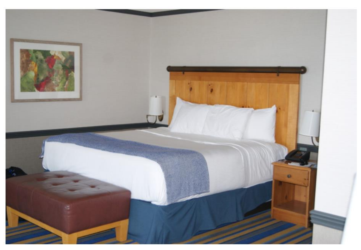
Waterview King Room at Semiahmoo