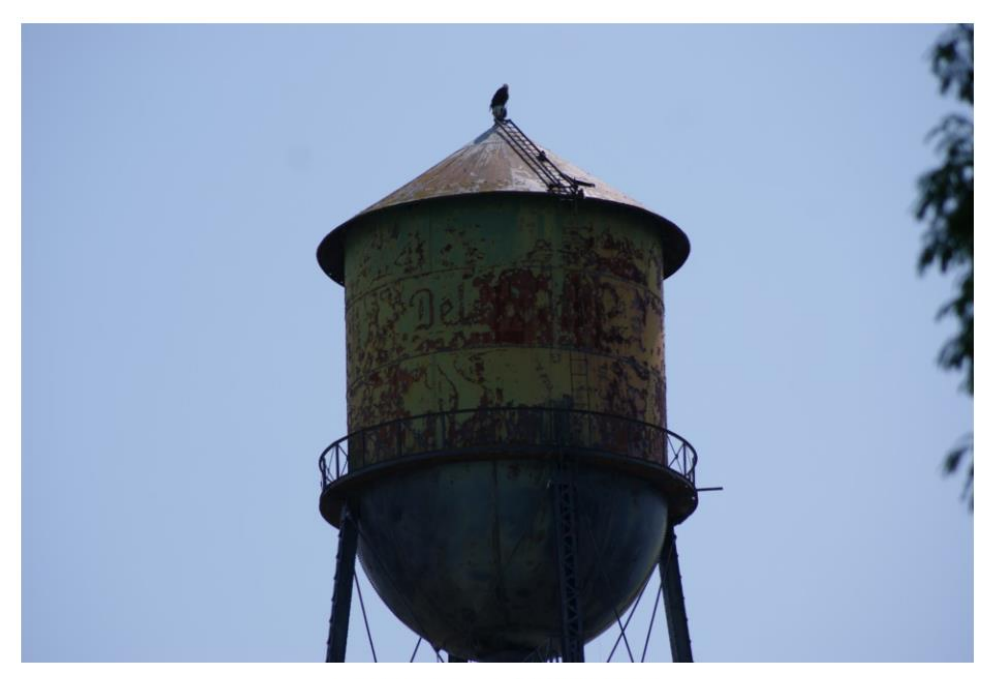
Bald Eagle on the Semiahmoo Water Tower