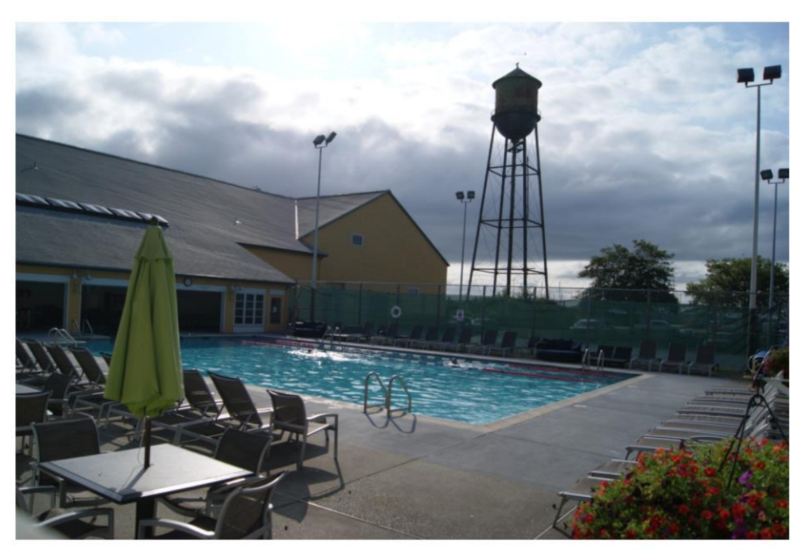
Semiahmoo Resort - Heated Pool and Water Tower

I enjoy a nice pool with convenient hours. That's why I always pack my suit! The outdoor pool at Semiahmoo is on the smaller side. Accessed through the spa entrance, the pool is enclosed by a screened fence, providing privacy from the adjacent parking lot. There is a great view from the pool area of the historic water tower, and plenty of lounge chairs to view it from. A hot tub, steam room and sauna are also on property for guests looking to warm up!