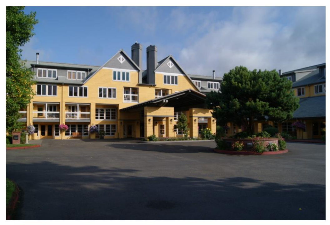
Entrance to the Semiahmoo Resort

At check-in guests are provided a "Things to Do" flyer. The flyer is packed full of events that the resort hosts, amenities, and places to explore. Unfortunately, my conference schedule didn't allow me time to take advantage of all the opportunities offered.