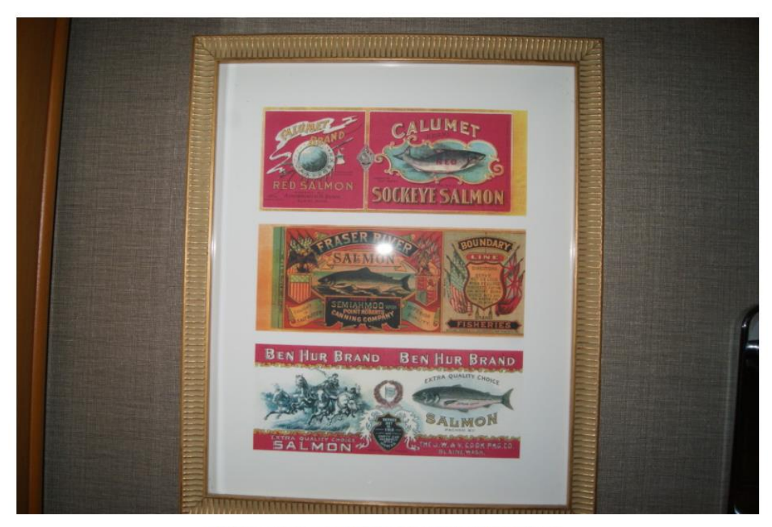
Historic canned salmon label artwork at Semiahmoo Resort

The room had impressive artwork. The pictures on the wall were reproductions of historic canned salmon labels. A very thoughtful way to tie the present-day resort to the history of the property. Originally, Semiahmoo was a salmon canning factory that opened in 1882.