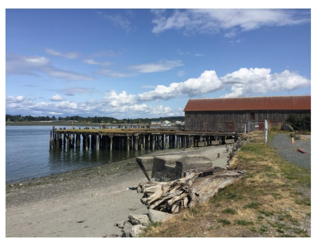
Dock at Semiahmoo Resort