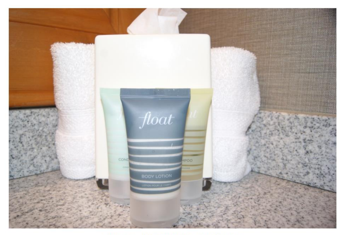
Float toiletries by William Roth at Semiahmoo Resort

The toiletries in the bathroom were the <u>float collection</u> by William Roth. I generally don't take notice of the toiletries provided at hotels, but the product appearance and name was a perfect fit for the resort. The products are heavily scented, but I didn't mind the perfume aroma. My wife on the other hand, found it to be too strong.